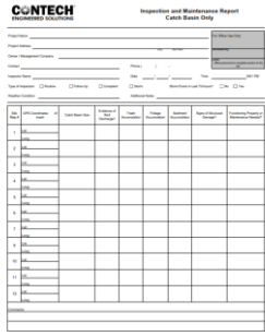
Contech Inspection and Maintenance Report

The following is a list of equipment to allow for simple and effective maintenance of the Grate Inlet Filter. It is recommended that a vacuum truck be utilized to minimize the time required to maintain the Grate Inlet Filter, though it can easily be cleaned by hand.