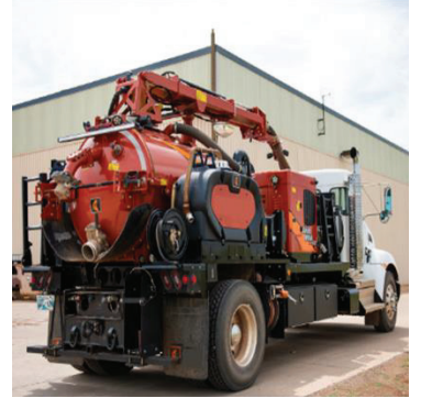
Vacuum Assisted Truck with Pressure Washer (Recommended)