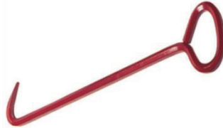
Access Cover Hook