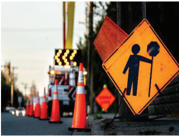
Maintenance and Protection of Traffic Plan